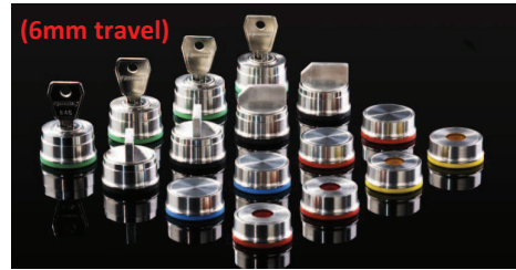
(6mm travel) Panel cut Front dimensions Contacts to suit (page 20) 22 mm 28 mm ET or M series

(for pricing see page 13 of Item Price List)