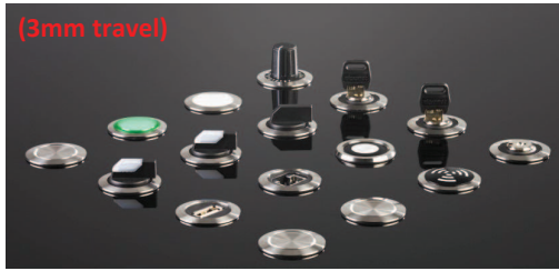
(3mm travel) Panel cut Front dimen- Contacts to suit (page 19) sions sions B Series